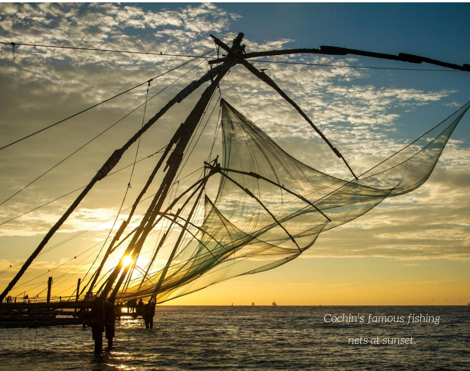
Cochin's famous fishing nets at sunset.